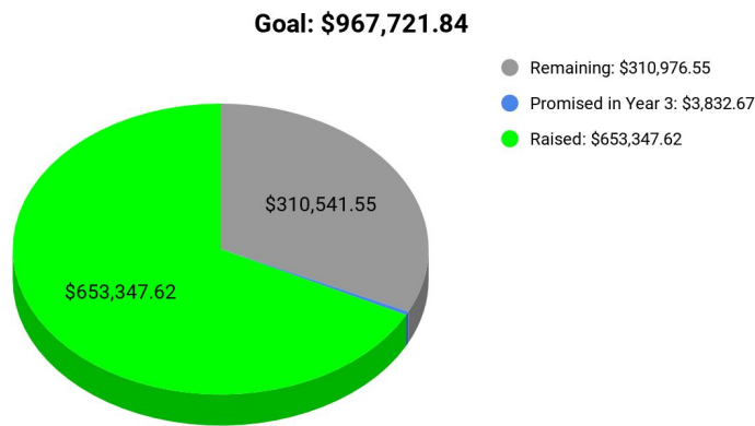
Figure 2. Progress toward the total project cost.